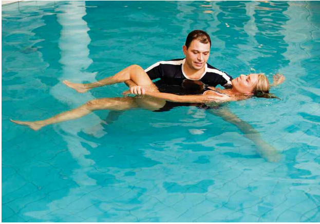
Water therapy boosts the immune system, stimulates the metabolism, circulatory and nervous systems, improves physical conditioning and invigorates the whole body.