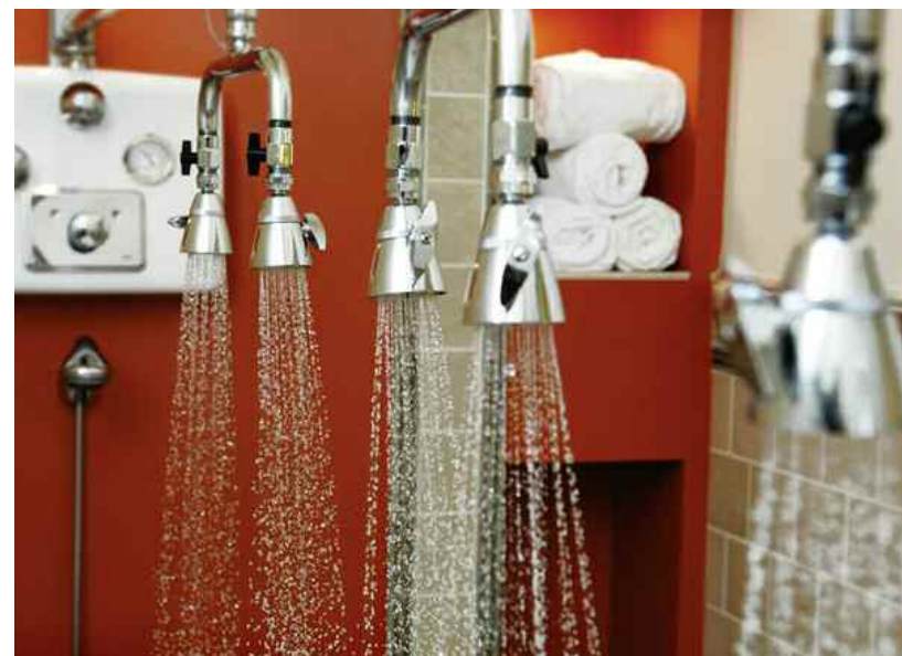
Horizontal vichy showers are among the most popular treatments at Spa Reveil in Austin, Texas.

Even with safety precautions and all the known benefits to water therapies, there are still plenty of apprehensions from